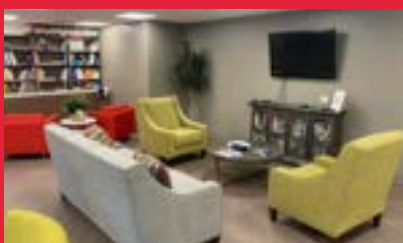
GILDA'S CLUBHOUSE Moline, IL